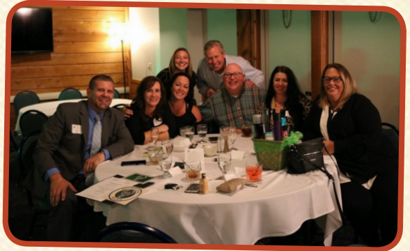
No shortage of FUN at this table!

A reverse auction also took place and saw many generous pledges of monetary support for HearthStone.