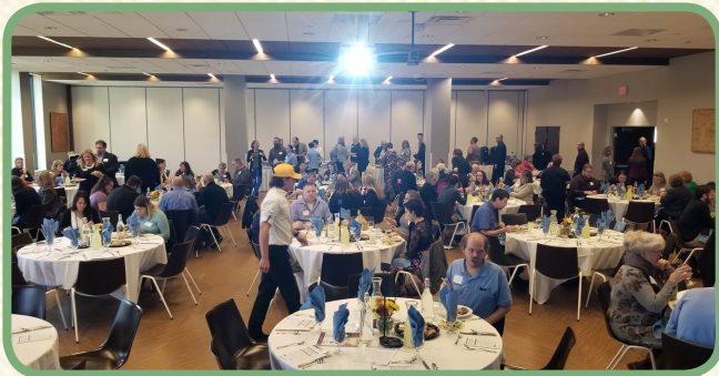
Employers were treated to an excellent buffet lunch at Lakeland University

Over 100 Sheboygan County Businesses were recognized for their efforts to hire and provide support for people with disabilities at the 16th Annual Employers Recognition Luncheon held at Lakeland University. The program featured several employers who shared employment success stories and introduced valued employees hired through RCS Employment Services.