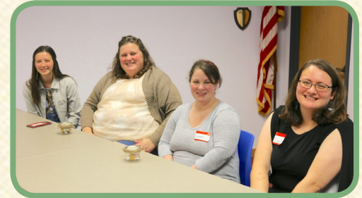
Our panel of Expert Siblings

According to Redman's research, siblings of individuals with a disability are more likely to have attributes such as empathy and maturity, but these are also accompanied by more negative characteristics such as anxiety.