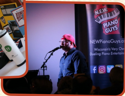
Duelling Piano Guys were great!

Thank you to all of our guests, donors, and sponsors for ensuring a successful year ahead for us with your generous support. Our young people are the direct beneficiaries of our community's heart to give. We're certain their thanks will shine through their smiles and passionate pursuit of their goals in the coming year.