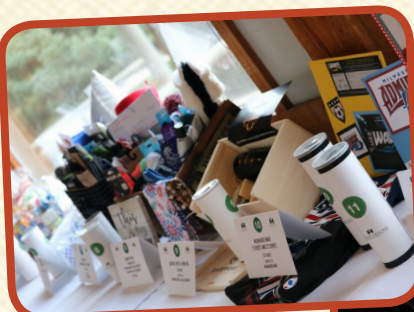
Thanks to our sponsors & volunteers the prize tables were full of goodies