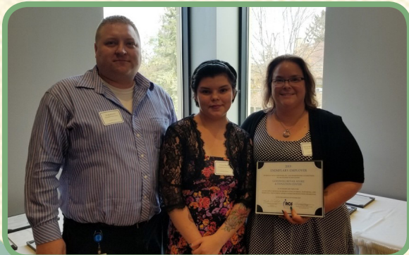
Sheboygan Goodwill Industries was honored as the 2019 Exemplary Employer