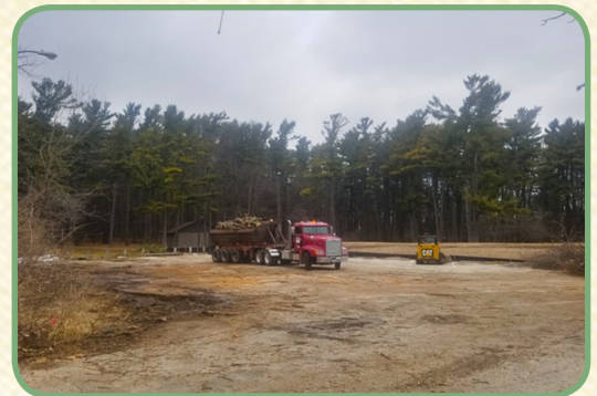
Getting ready! Doesn't look like much right now, but the site clearing has begun and fill is being added.

http://shawfamilyplayground.com/order-form-for-engraved-fence-pickets/