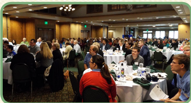
Hundreds enjoy a buffet lunch and awards ceremony at the Bull at the HearhStone/RCS Empowers employers' recognition luncheon.