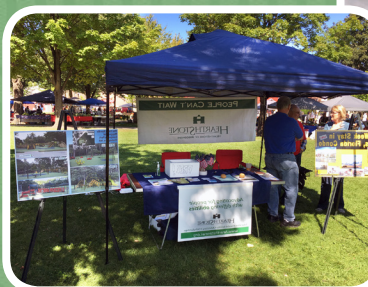
HearthStone information booth at the Unity Event.

Plans are already underway for next year’s event!