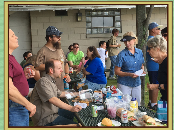
Nothing like a picnic lunch on beautiful Elkhart Lake