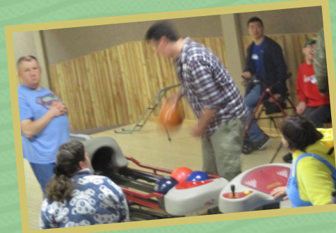
Bowling was fast and furious at our annual bowling party.