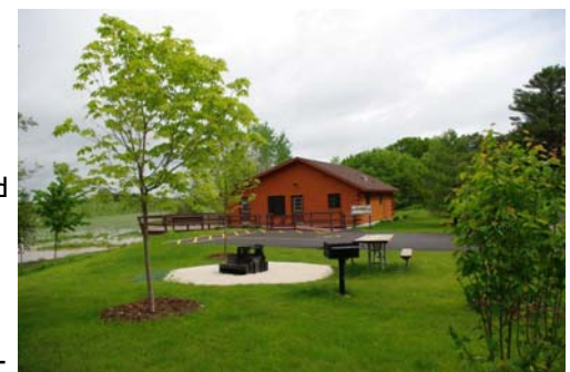
The "Accessible Cabin" at Kohler-Andrae State Park

are consistently at a high occupancy rate and the need especially in the Southeast is obvious for additional cabins. This project must be entirely funded with donor contributions. The Friends estimate $150,000 is needed. The money by State mandate must be collected before the project ground breaking. This is a challenge; the Friends are optimistic and hope to have the money and shovels in the ground within two years. Occupancy by Fall of 2014 or Spring of 2015. Everyone needs to get closer to nature and enjoy the scenic beauty found in our state parks. You can help make the accessible cabin a reality for many handicapped and special needs campers